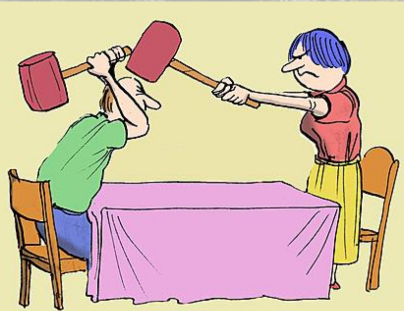
Another successful session of conflict resolution.